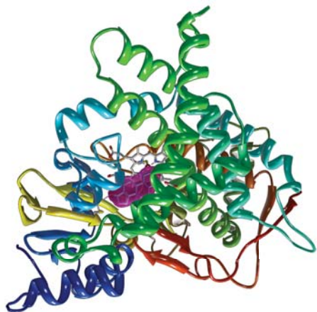
Structure of human placental aromatase. Aromatase is the key enzyme in producing estrogen. By knowing this structure, drugs can be designed to block the production of estrogen which can help 75 to 80 percent of breast cancer patients.

For more than 50 years, the Hauptman-Woodward Institute has been a world leader in crystallographic theory and practice in structural biochemistry and biology. As we continue to grow, we will be recruiting at all levels to join our team. If you are looking for an exciting professional environment utilizing state-of-the-art technologies which encourages collaboration and cooperation among staff members and provides you with the freedom to develop your own independent research program, then HWI is the right place for you.