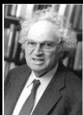
Dr. Herbert A. Hauptman