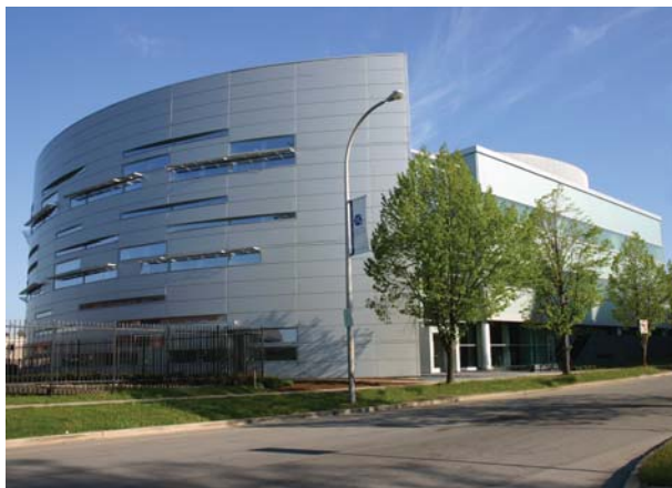
Hauptman-Woodward's New Building

The HWI facility has three major components: an office complex, a glass-enclosed atrium, and a laboratory complex. Two floors of the building are devoted completely to scientific endeavors comprised of offices for scientific staff and laboratory facilities.